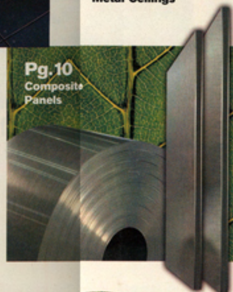
Pg. 10 Composite Panels

Presorted Standard U S Postage PAID East Greenville, PA Permit No. 734