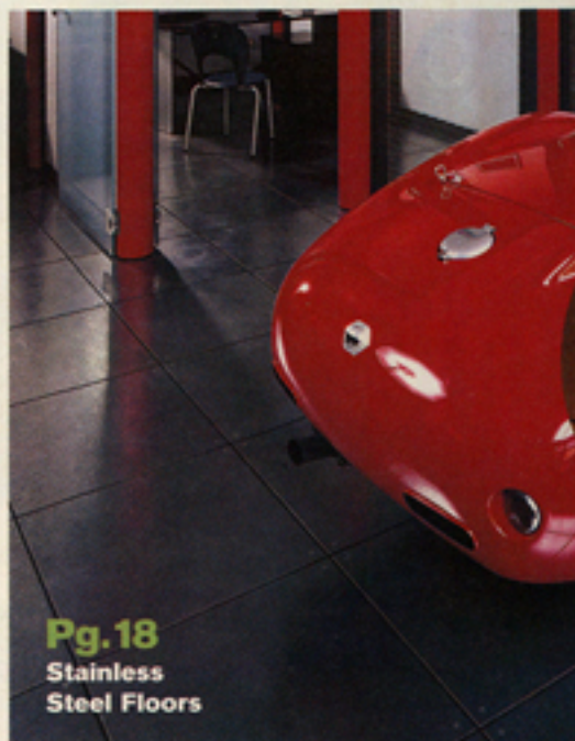
Pg. 18 Stainless Steel Floors